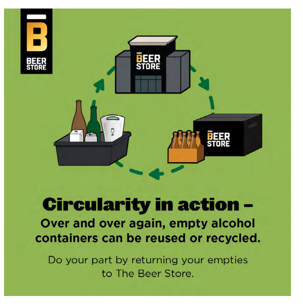
IMAGE: social media post demonstrating how empty alcohol containers contribute to circularity by being reused or recycled.

This year, the TBS marketing team organized a number of campaigns to increase awareness of our deposit-return program as well as the ODRP. Utilizing both online and outdoor media platforms, we released posts to remind customers about the environmental as well as economic benefits of returning empty beverage alcohol containers to TBS. Additionally, we ran a holiday marketing campaign in an effort to boost returns during the busy holiday season.