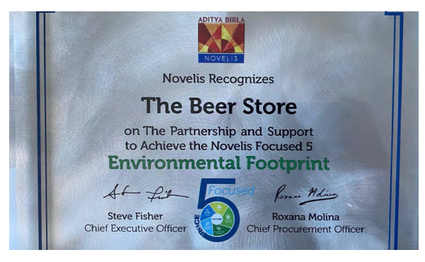
IMAGE: Award received by TBS from Novelis stating: Novelis Recognizes The Beer Store on The Partnership and Support to Achieve the Novelis Focused 5 Environmental Footprint"